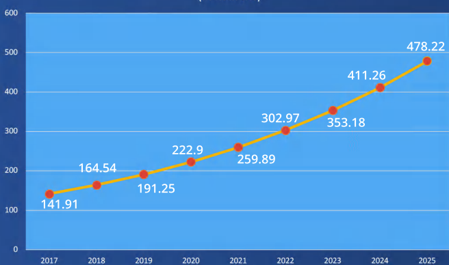
Number of Smart Homes forecast in the world from 2017 to 2025 (in millions)

The projected compound annual growth rate (CAGR) for the period between 2022 and 2030 is 27.04% for the expected expansion.